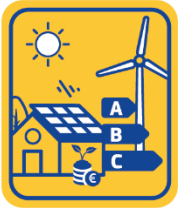
Clean Energy Transition

predecessors: Intelligent Energy Europe continued under H2020 Energy Efficiency